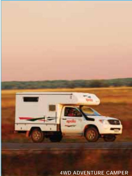
4WD ADVENTURE CAMPER

With ten conveniently located depots throughout Australia including Darwin and Alice Springs in the Northern Territory, Apollo Motorhomes offer a wide range of quality campervans, all of which are modern and well appointed.