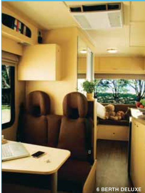
6 BERTH DELUXE

KEA's supremely comfortable 2, 4 and 6 berth, campervans, motorhomes and 4WDs are the perfect way to enjoy Australia's unique and beautiful environment, friendly people and relaxed lifestyle.