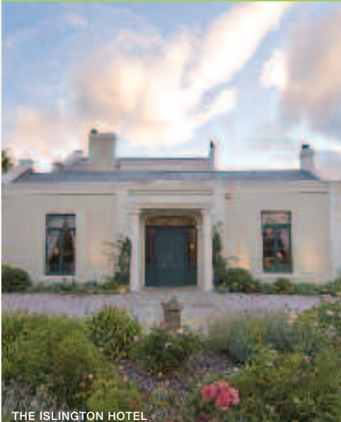
THE ISLINGTON HOTEL

Enjoy a four night break discovering the very best of Tasmania. Stay at The Islington Hobart for two nights of splendour. Wake up to a gourmet breakfast in the Conservatory and spend time in Hobart exploring the many galleries and boutiques or visit a local winery. On one evening enjoy the culinary delights of the Islington's resident chef.