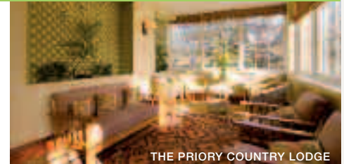
THE PRIORY COUNTRY LODGE