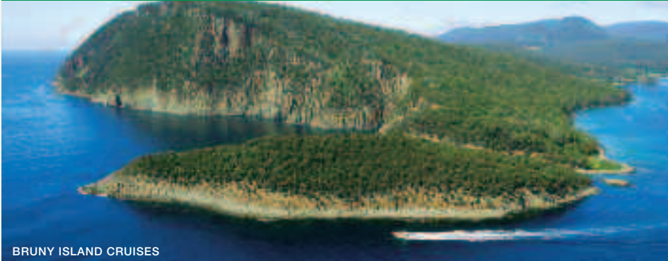
BRUNY ISLAND CRUISES