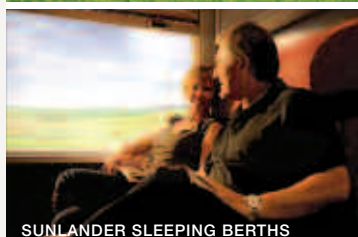
SUNLANDER SLEEPING BERTHS