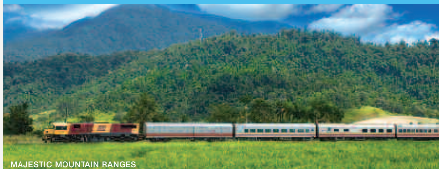
MAJESTIC MOUNTAIN RANGES