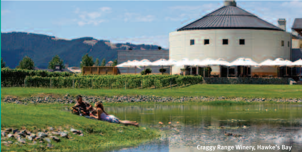
Craggy Range Winery, Hawke's Bay