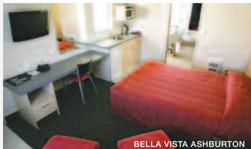
BELLA VISTA ASHBURTON