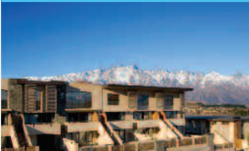
GARDEN COURT SUITES AND APARTMENTS, QUEENSTOWN