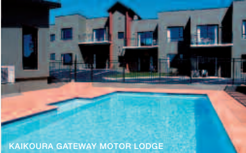
KAIKOURA GATEWAY MOTOR LODGE