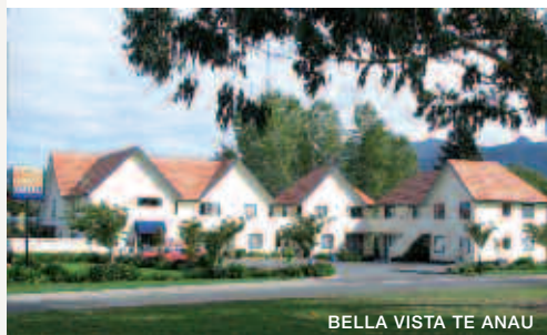
BELLA VISTA TE ANAU

Bella Vista Motels is renowned throughout New Zealand for purpose built, single design properties that are easily recognisable inside and out. With consistent four star Qualmark standards and friendly local hosts, the motels are a safe, secure option guaranteeing great value at any one of the 28 locations.