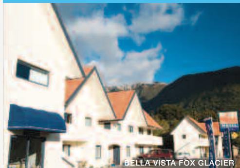
BELLA VISTA FOX GLACIER