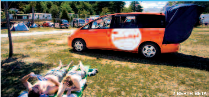
2 BERTH BETA