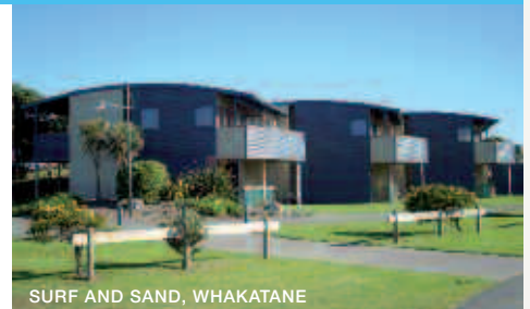
SURF AND SAND, WHAKATANE

Hotels, studios and apartments are available in city and regional locations throughout North Island and South Island. Ask your travel agent for details.