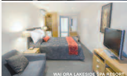
WAI ORA LAKESIDE SPA RESORT

No matter where you go, Choice Hotels, representing the Econo Lodge, Comfort, Quality and Clarion brands has a place to stay that will make you feel right at home.