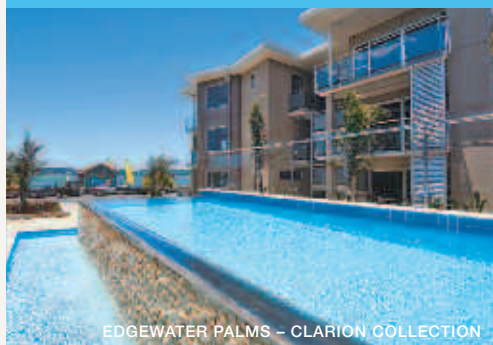
EDGEWATER PALMS – CLARION COLLECTION