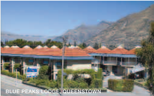
BLUE PEAKS LODGE, QUEENSTOWN

The Go Kiwi Hotel Pass and Golden Chain Motel Pass are convenient, flexible and cost effective ways to travel throughout New Zealand.