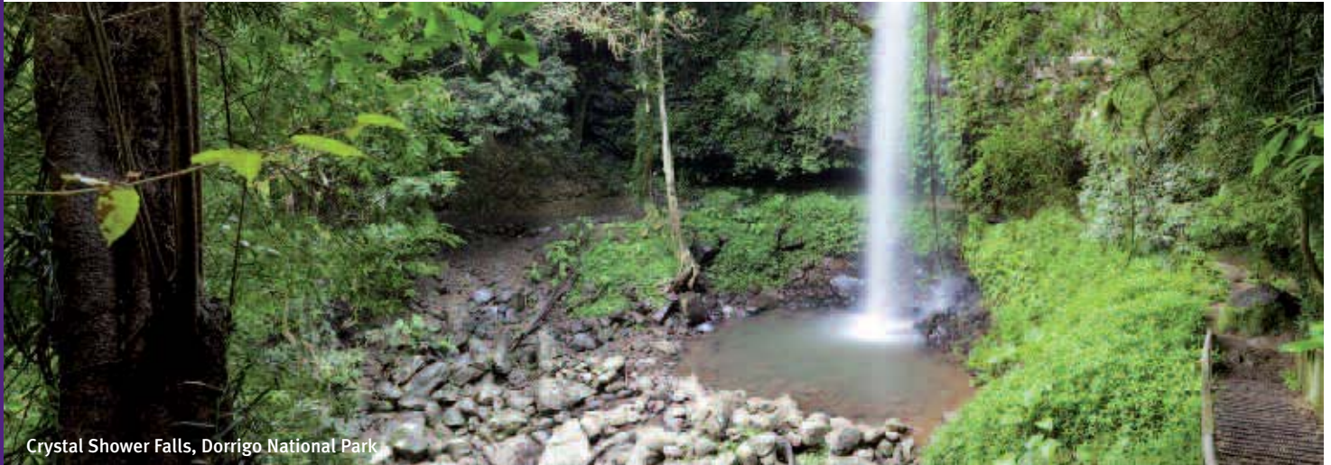
Crystal Shower Falls, Dorrig National Park